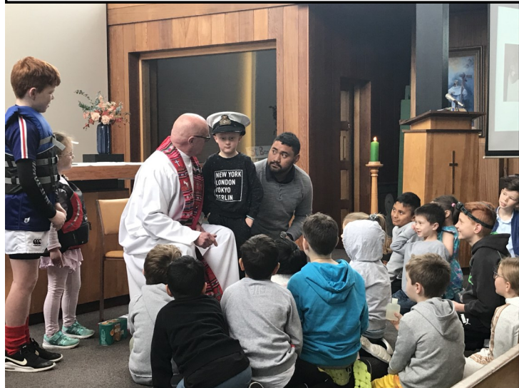
Photo from the children's Mass at St Ben's last week